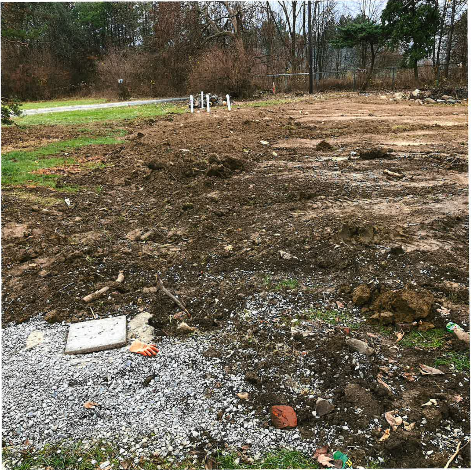
2225 McComb Road Jackson Township 12/11/2023